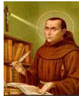
St. Paschal Baylon

All turnos should hold, at least, one hour vigil every May 17 to honor St. Paschal Baylon as the patron saint.